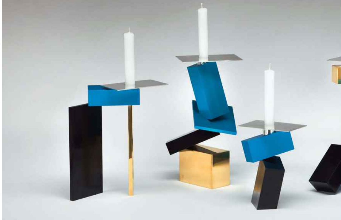
Hervé Van der Straeten, Twist candleholders, 2011, edition of 36.

which opened in the Marais quarter in Paris in 1999. The Van der Straeten style features precious materials, a love of bronze and gold and harmonious proportions as a common denominator. He then adds rare materials like obsidian and iridescent or coloured glass, and others with less flattering reputations like fibreglass, Plexiglass and aluminium. All these make play with different inspirations borrowed from the 20 th century, but they are readapted with skill and imagination, thus standing as creations in their own right. The next collection, made up of twenty-four new pieces, is based on the theme of the oblique. The out-of-true, the slanting, feet positioned askew and movement form the grammar of this collection. As for materials, we note the appearance of